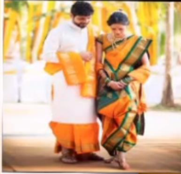
Traditional Dress Female: Navari Saree Male: Sadra and Dhoti