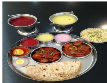
Kolhapuri Mutton plate with Tambada and Pandhara Rassa (outside the plate)

Kolhapur is a foodie paradise. Kolhapuri food is world famous for its taste & Traditional Delicacies. Though it is being misrepresented as very spicy food worldwide, but the truth is that it is very less spicy, and the unique taste being due to the use of